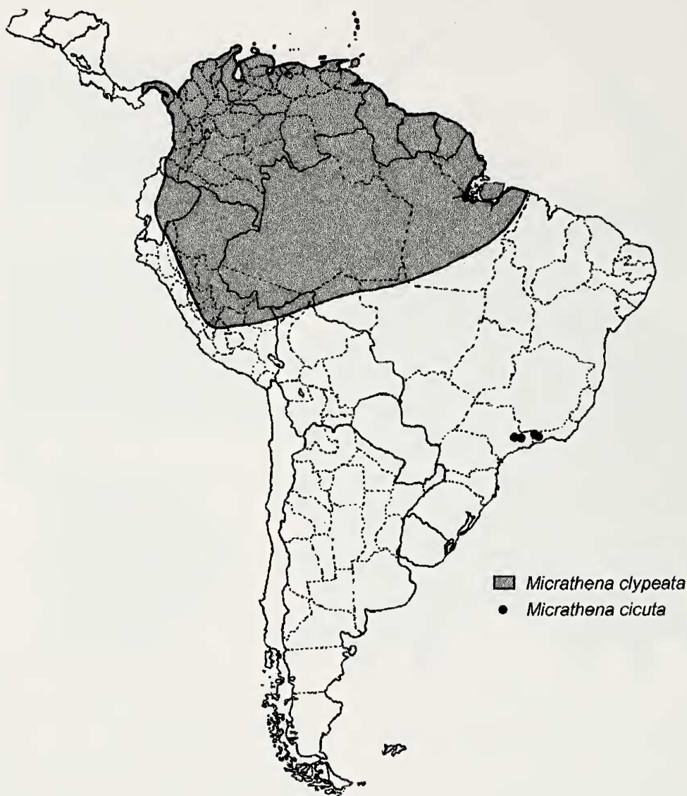
Figure 5.—Geographic distribution of Micrathena clypeata (gray area, based on records from Levi 1985) and locality records for Micrathena cicuta new species (circles).

by Levi (1985), and the type specimens are lost like so many of the species described by Walckenaer (1842). According to the original description (Walckenaer 1842:174), M. degeeri possesses an oval-triangular abdomen with 12 spines: an anterior pair of small ones (described as “médiocre” by the author), a pair of large and diverging posterior spines with two small ones on the base, one dorsal and one ventral. The sides of the abdomen were described as bearing two small spines. This description matches Levi’s (1985) illustrations of Micrathena plana , a species distributed from Panama and the West Indies to Argentina, and the only species with 12 abdominal spines recorded from Suriname.